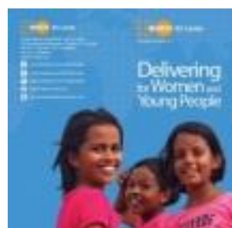
Delivering for Women and Young People (2014)