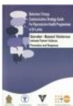
Behaviour Change Communication Strategy for Reproductive Health Programmes in Sri Lanka (2014)