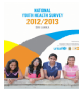
National Youth Health Survey 2012/2013 (2016)