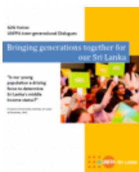
Generation to Generation Dialogue Available in Sinhala and Tamil (2015)