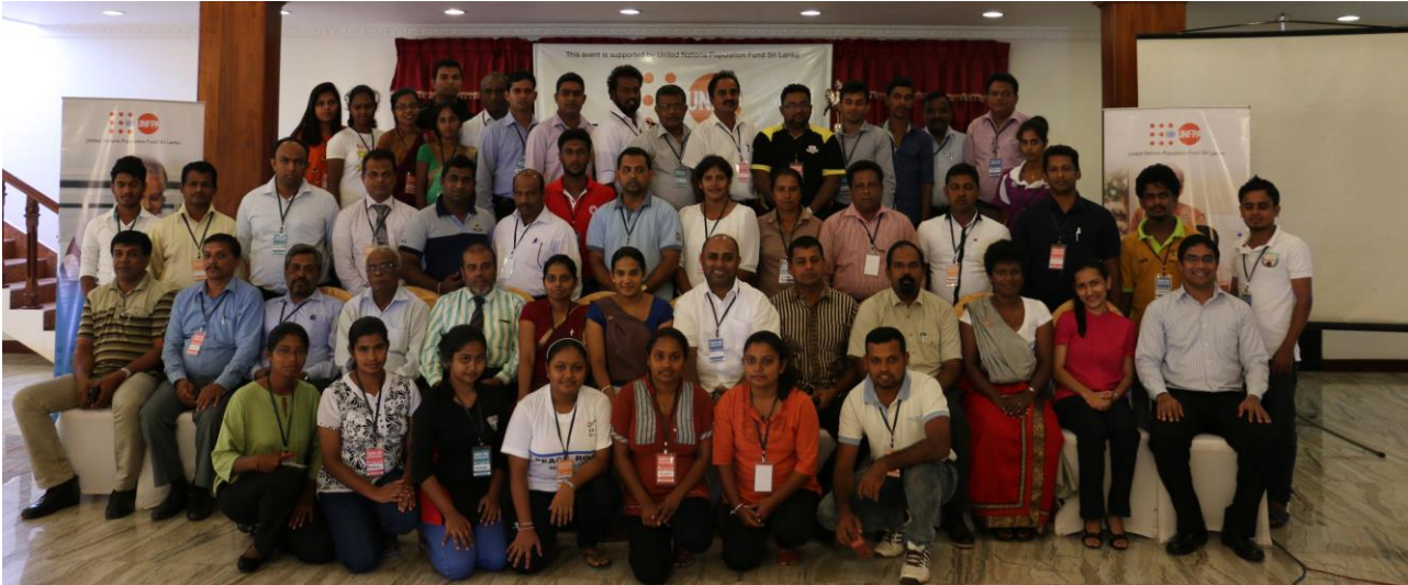
Group picture taken at the consultation 15 – 16 July 2016, Embilipitya

This consultation was supported by the Honourable Provincial Minister, Secretary and the Provincial Director of Health and senior officials of the respective ministries. Further, the following key officials participated and contributed toward developing the draft recommendations on youth for the Province; Vice Chancellor of the Sabaragamuwa University, Provincial Health Director and officials, Police Public Relations Officer, National Youth Services Council Sabaragamuwa Provincial Director, Former Chief Secretary of the Province and youth leaders from both districts including civil society organizations.