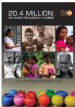
20.4 Million: Sri Lanka's Population at a glance (2015)