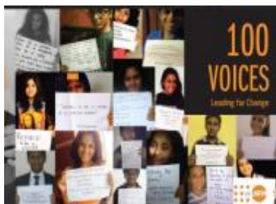
100 Voices Campaign Leading for Change (2015)