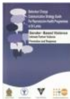
Behaviour Change Communication Strategy for Reproductive Health Programmes in Sri Lanka (2014)