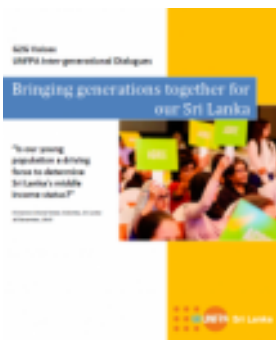
Generation to Generation Dialogue Available in Sinhala and Tamil (2015)