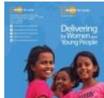
Delivering for Women and Young People (2014)