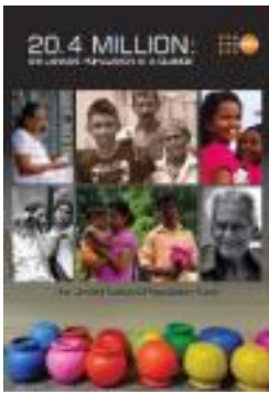
20.4 Million: Sri Lanka's Population at a glance (2015)