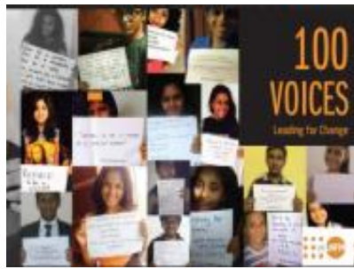
100 Voices Campaign Leading for Change (2015)